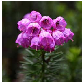
Pink Mountain Heather: