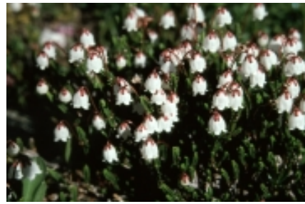
White Mountain Heather: